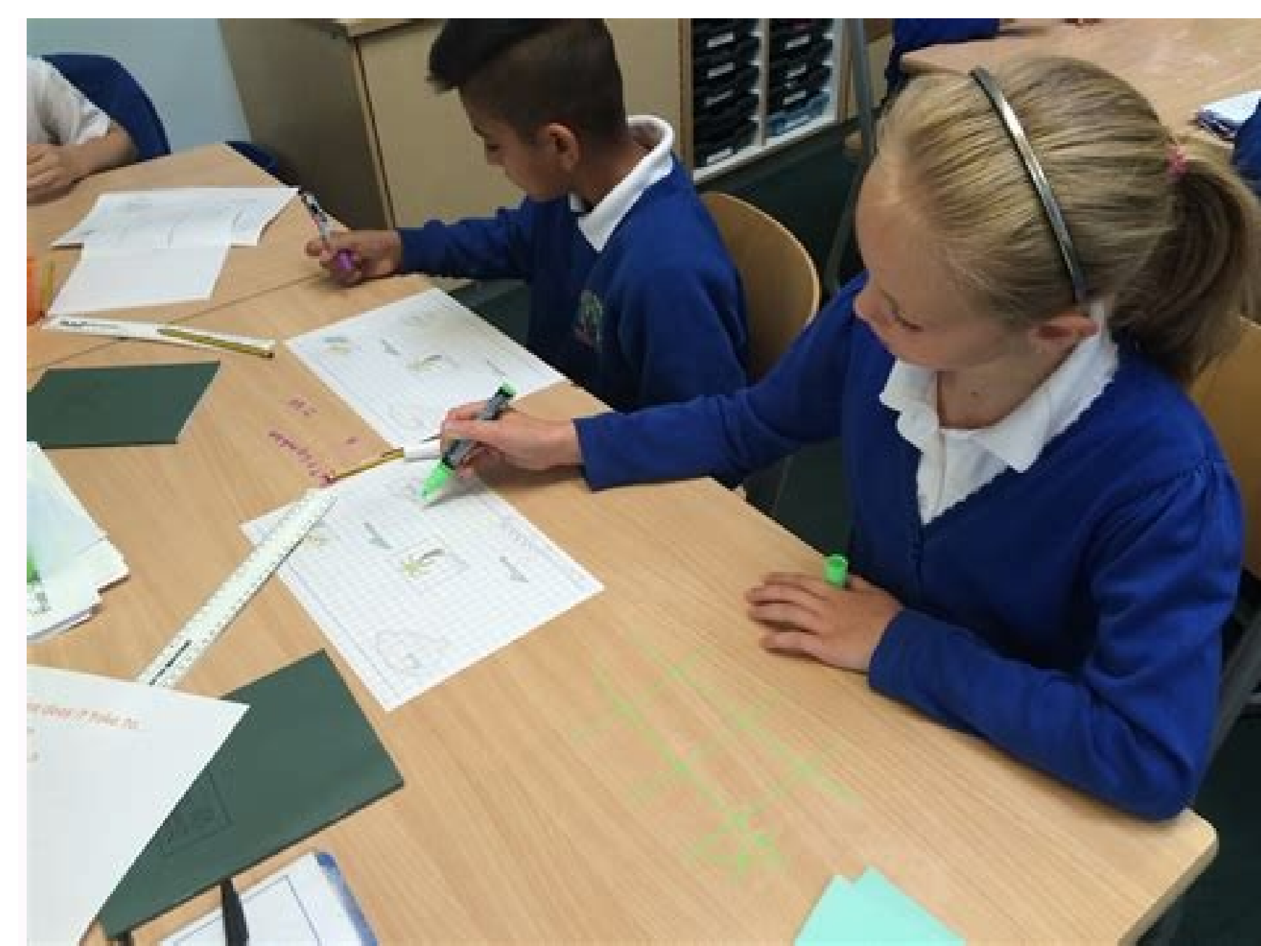
Cheam high school uniform rules.